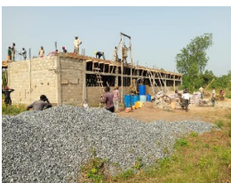
Concrete being made (12/19/2021)

On Sunday 23 th , we had our very first church services in this School building. We are planning on having an evangelism campaign from Wednesday February 9 th to 12 th and the inaugural Church services on Sunday 13 th