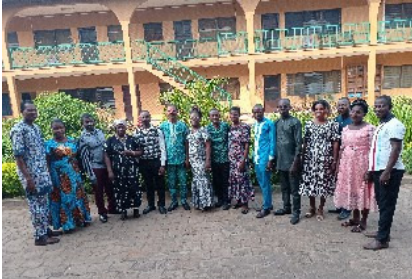
Our Co-workers (01/21/2022)

Greetings in Christ from Togo to all of you! We pray that each one of you be in good health and prosperous in Christ our Lord this year.