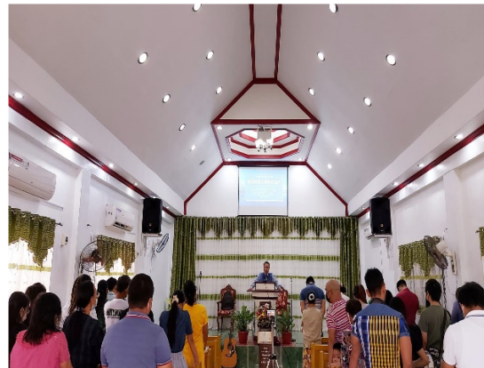
First Sunday of the year service and Lord Supper