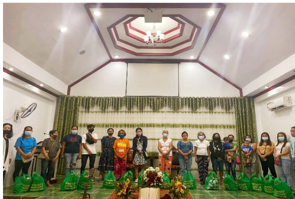
1 st Batch of benevolence ministry recipients