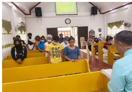
Gospel preaching to recipients of B.M.