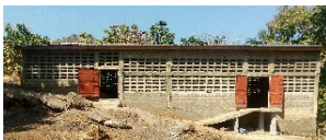
WLBC church building

We are praying here for numerical and spiritual growth. It looks like people in this area do not respond well to the gospel.