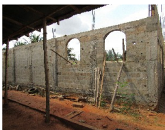
Construction work progress

The reopening of the church here is particularly welcomed, because for 19 months the services were held in houses and the preaching sent via WhatsApp.