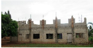
Church building work progress

Since the discipline and dismissal of our co-worker who was in charge of the work here, we are doing our best to keep the church activities going on. The attendance is still low. We are prayerfully asking the Lord to provide for the right man who will be in charge of the work. It is also our prayer that the church's testimony be restored.