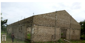
Church building work progress

Putting the roof on this building is the main challenge here. About $1,500 is needed to achieve this.