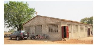
HBC church building