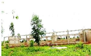
School building work progress

This is the picture of the construction work progress. This building is designed to be used for three school classes. We are planning to start our Christian school here by September 2022. The school classes will also be hosting Sunday school classes and church services. We are praying for financial provision in order to complete the work by summer 2022. We expect to baptize the very first group of about fifteen new converts very soon. We need your prayers for this new field.