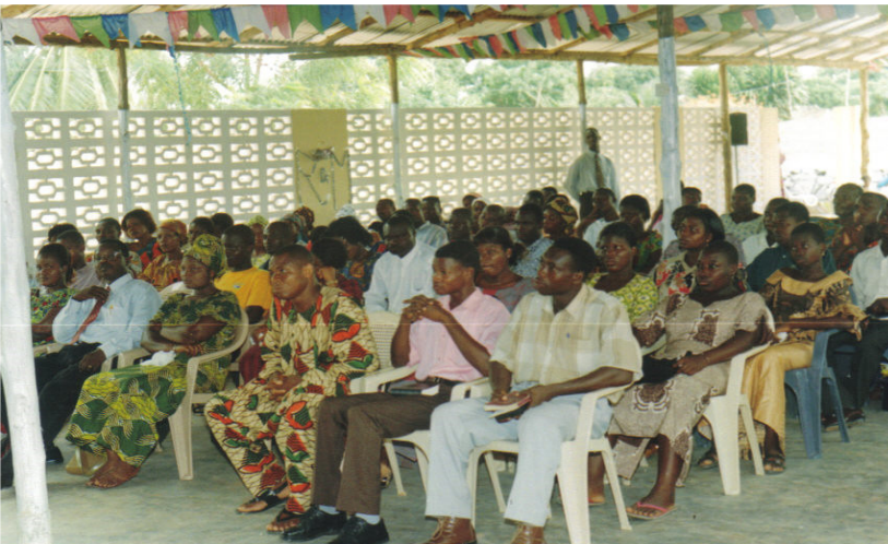
Sunday morning church services under a shelter in 2006

Prayer Requests : (1) Church building completion, (2) numerical and spiritual growth, (3) autonomy.