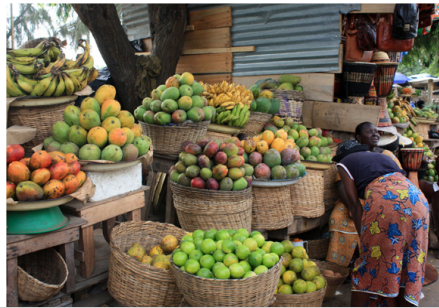
Open air fruit market