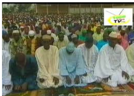
Open air Muslim prayer