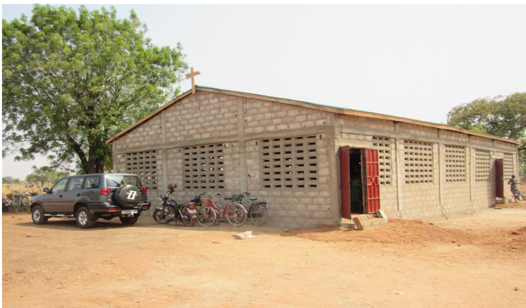
The Church building in February 2017