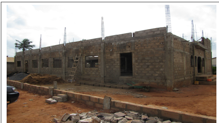
Church construction progress in August 2018