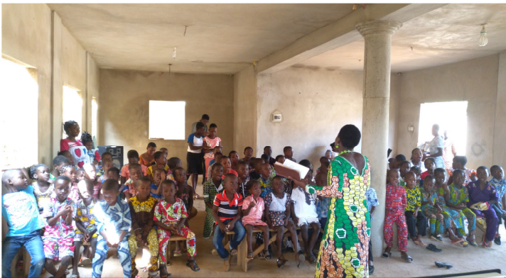
Children Sunday Morning services, August 2018