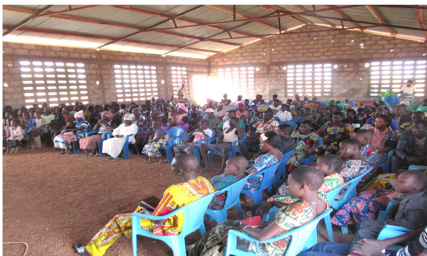
The crowd on the Inaugural Sunday, February 12, 2017 after three days Evangelism campaign.