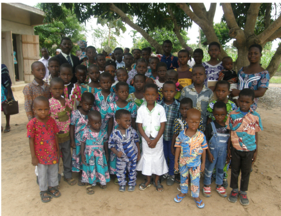
Children after Sunday morning services, August 2018