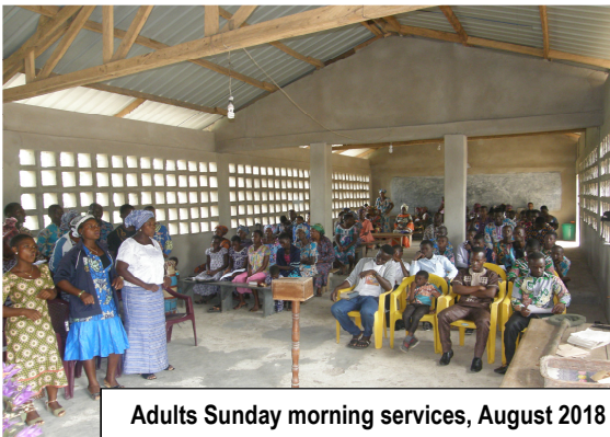
Adults Sunday morning services, August 2018