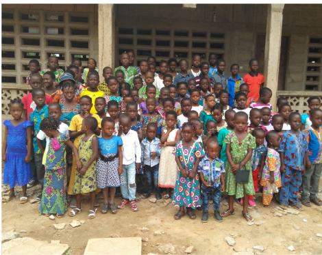
Children after Sunday morning services, August 2018