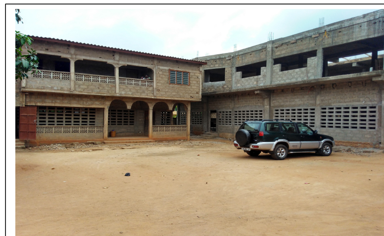
Church Construction progress (for children and Adults)