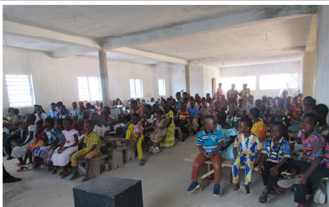
Sunday morning children church services, August 2018