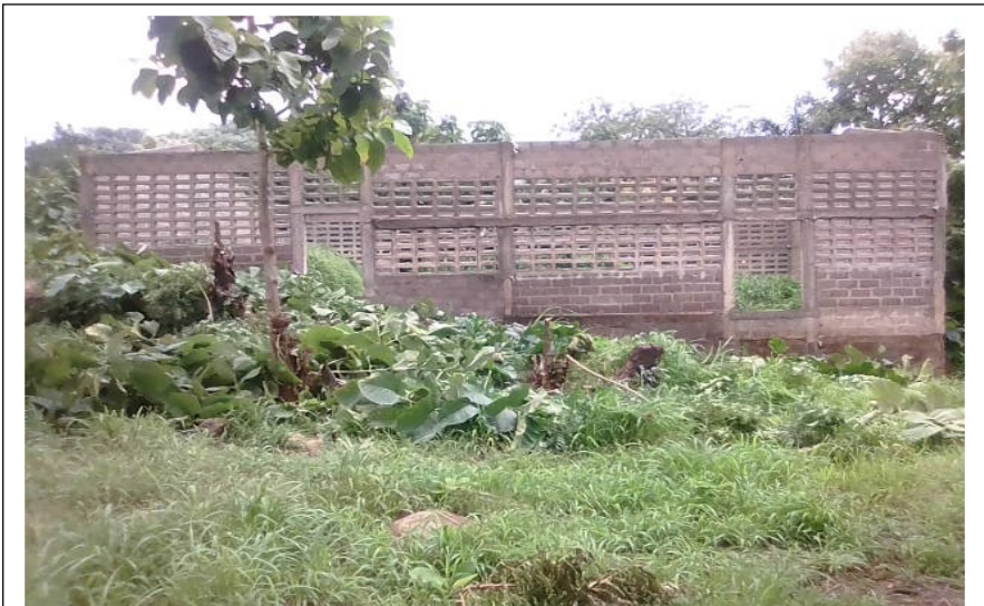
Church building progress, August 2018

Prayer Requests : (1) the Lord's provision to cover the church building, (2) the evangelism campaign in November (3) A good crowd on the inaugural Sunday.