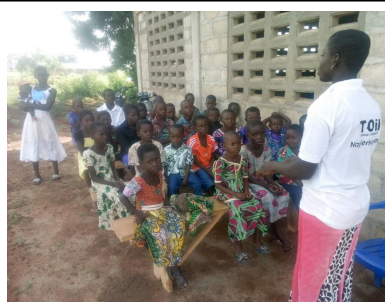
Children Sunday school, August 2018