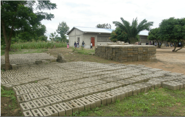
Cement blocks ready for the church construction