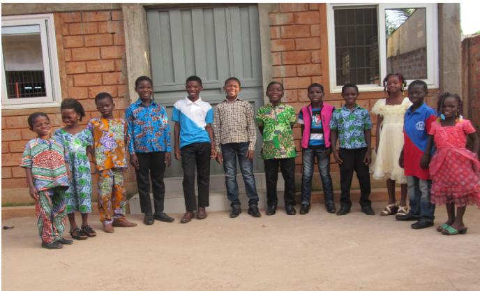
The Redeemer House kids (3 girls and 9 boys, 7 to 14 years old)