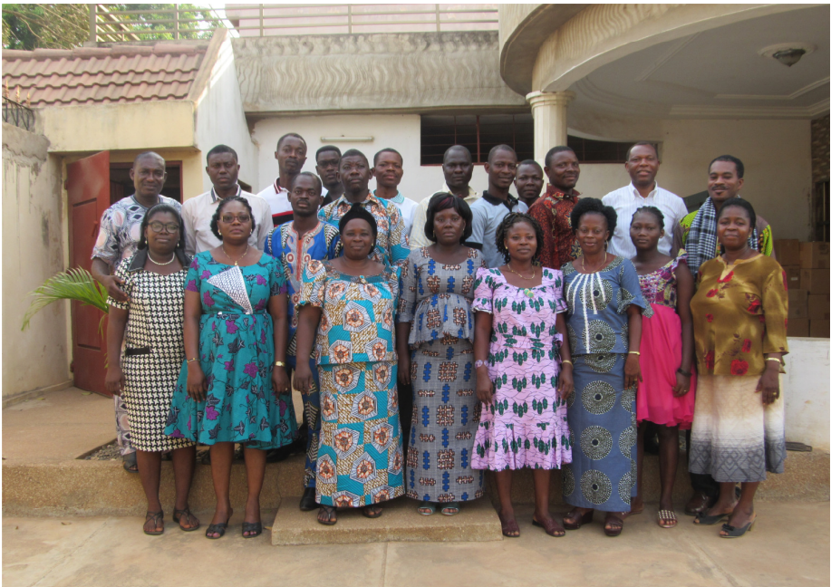
Annual fellowship with our full time co-workers' and their wives in our house on February 16, 2018