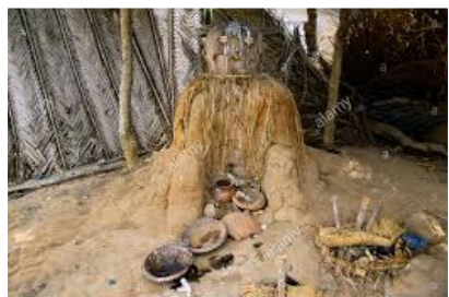
An example of idol