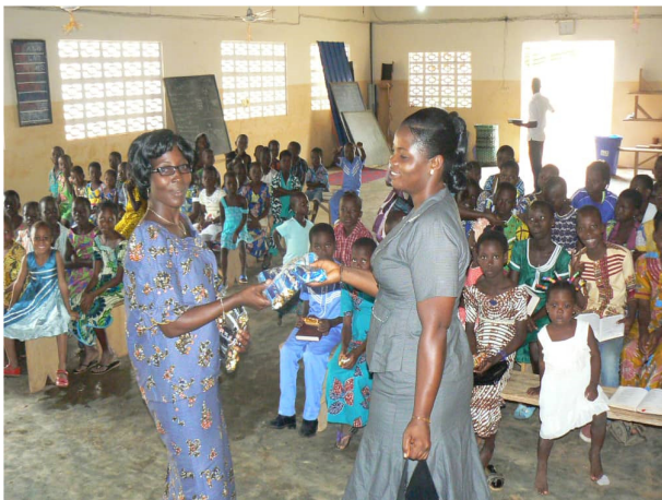
Children Sunday Morning services