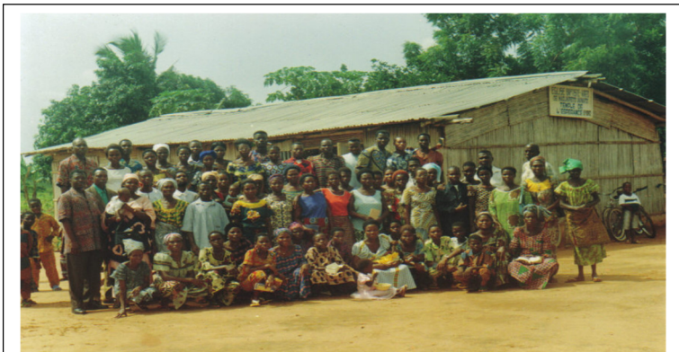
The church members in front of the shelter (temporary place of worship in 2006)

Prayer requests: (1) Church building completion, (2) numerical and spiritual growth, (3) autonomy due in 2020, (4) Church members commitment, (5) Job for church members