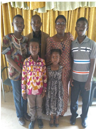
The Kounglenou Family