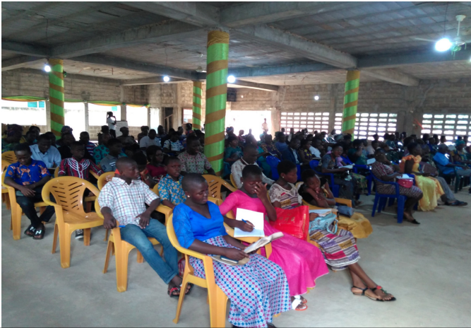
Adults Sunday morning services, August 2018