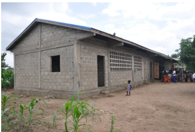
School Building: used for both school and church services