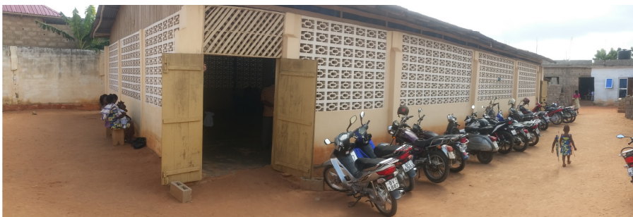
Current Church shelter