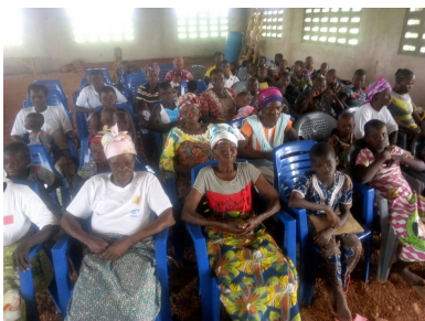
Sunday morning services, August 2018