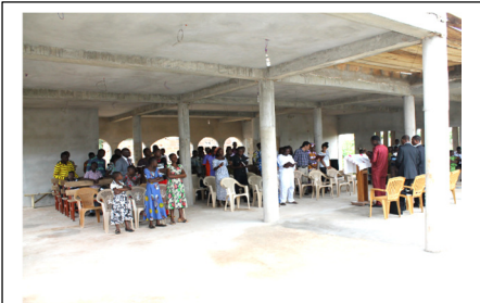
Inaugural services: Adults, October 19, 2014

Prayer Requests: (1) Church building completion, (2) numerical and spiritual growth, (3) autonomy due in 2025.