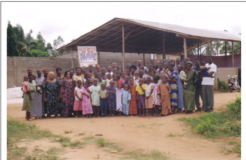
Adults and Children in front of the shelter in 2006

Prayer Requests: (1) Church building work be started by February 2019, (2) soul winning efforts be productive, (3) spiritual and numerical growth.