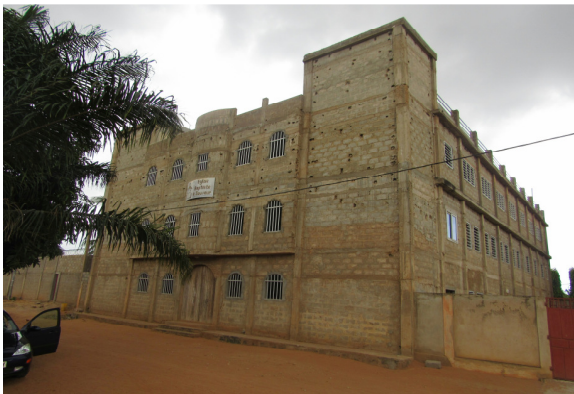
Church construction progress in August 2018