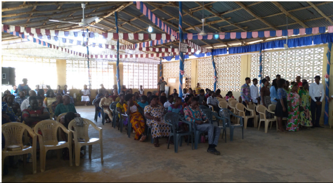
Adults Sunday Morning services, August 2018