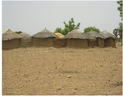
A Northern Typical Village houses