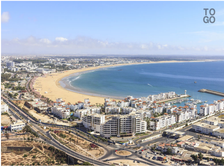
Lomé, the Capital City (Harbor area)