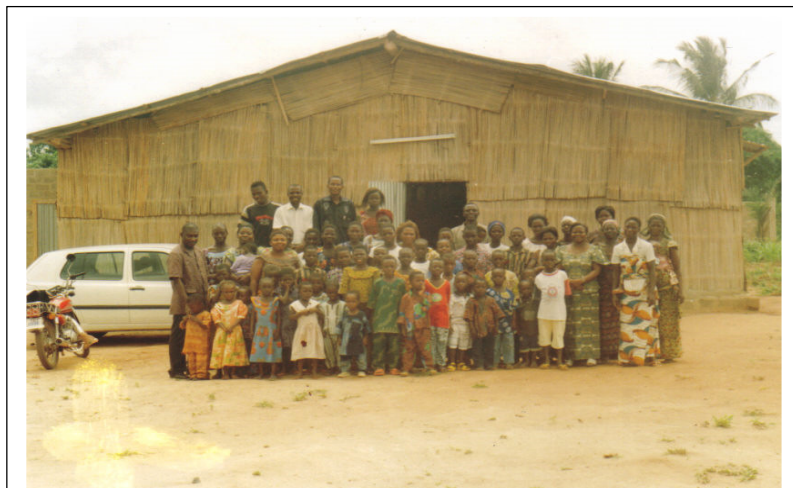
Adults and Children in front of the shelter in 2006

Prayer Requests: (1) Church building completion, (2) numerical and spiritual growth, (3) autonomy due in 2020.