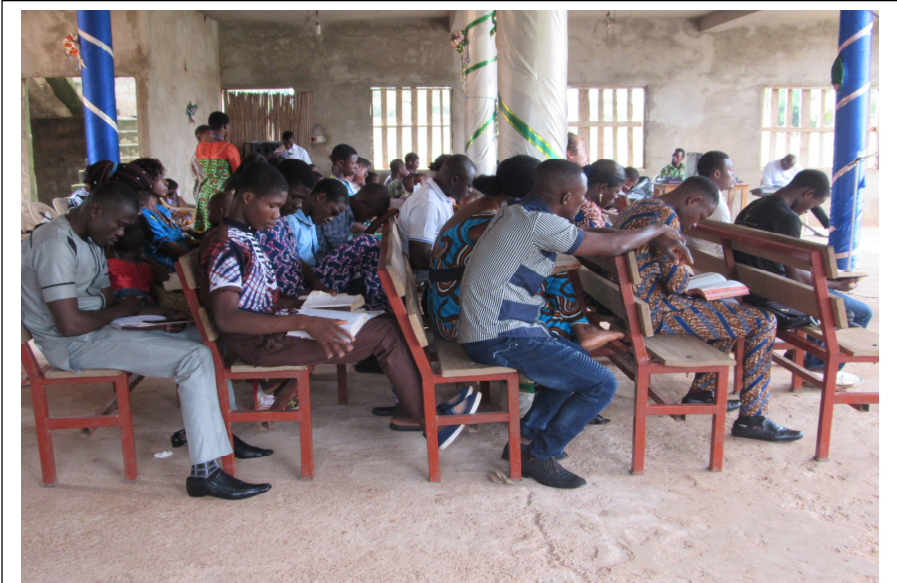
Sunday morning services, August 2018