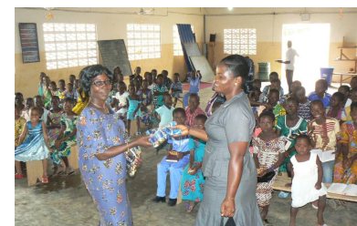
Adults Service (new building) and Kids Service (former building)