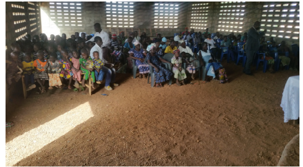
Sunday morning church services