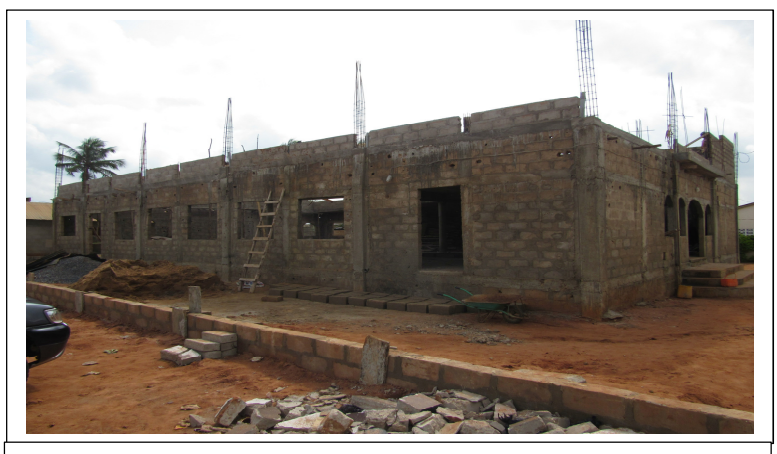
Church construction progress in August 2018

The church members in front of the shelter (temporary place of worship in 2006)