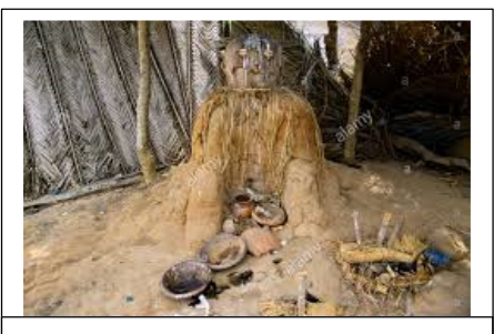
An example of idol