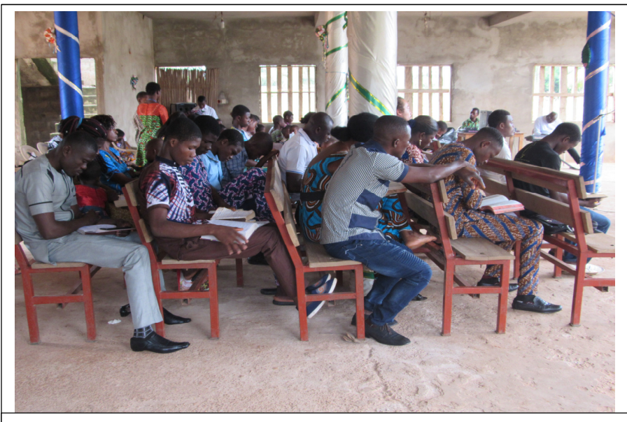
Sunday morning services, August 2018