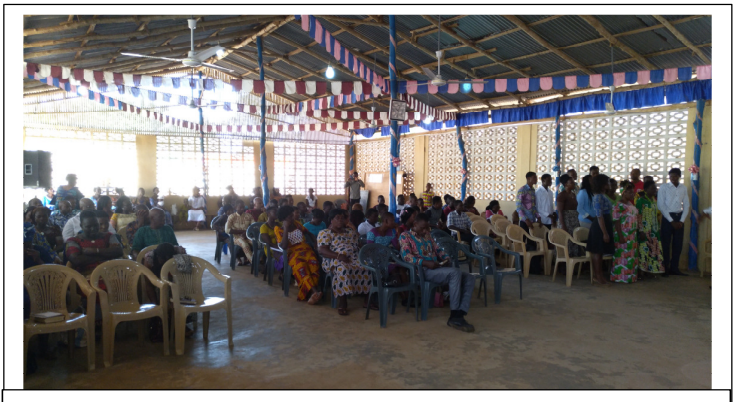
Adults Sunday Morning services, August 2018