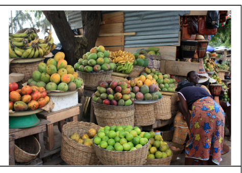
Open air fruit market