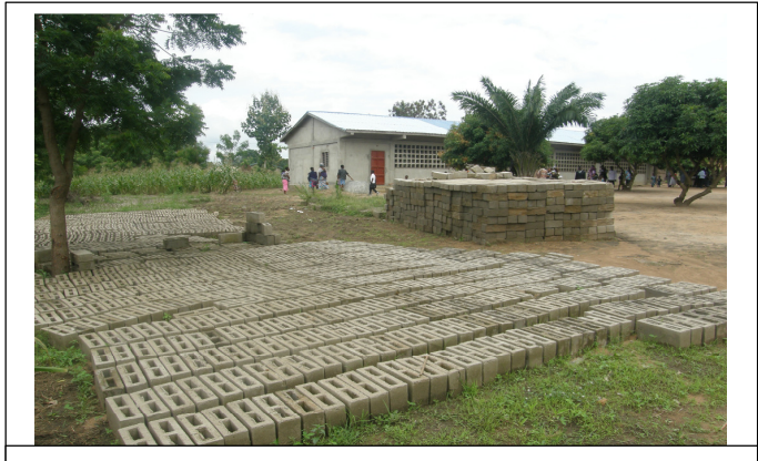
Cement blocks ready for the church construction