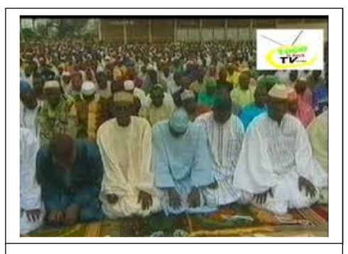
Open air Muslim prayer