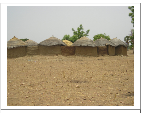
A Northern Typical Village houses