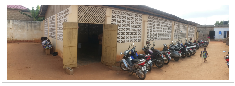
Current Church shelter