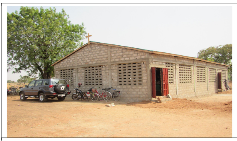
The Church building in February 2017