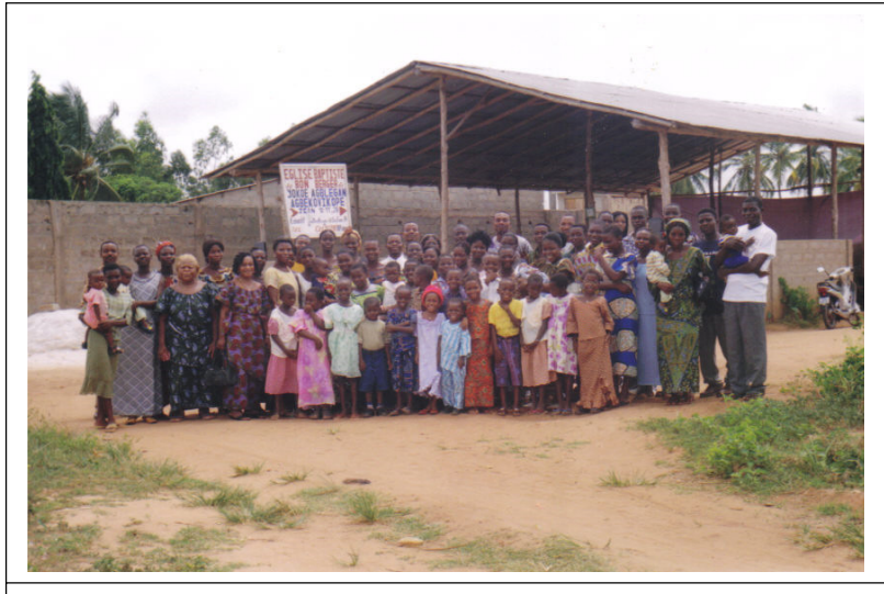
Adults and Children in front of the shelter in 2006

Prayer Requests : (1) Church building work be started by February 2019, (2) soul winning efforts be productive, (3) spiritual and numerical growth.