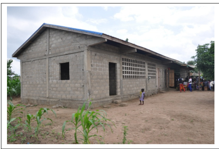
School Building: used for both school and church services