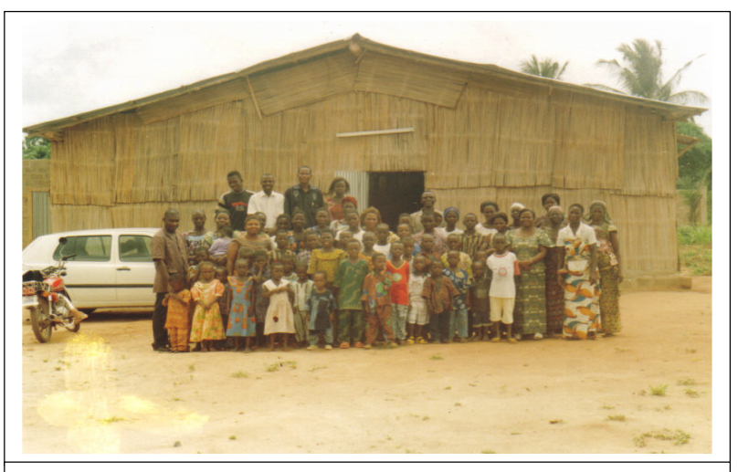
Adults and Children in front of the shelter in 2006

spiritual growth, (3) autonomy due in 2020.