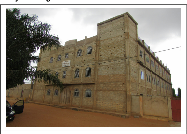
Church construction progress in August 2018