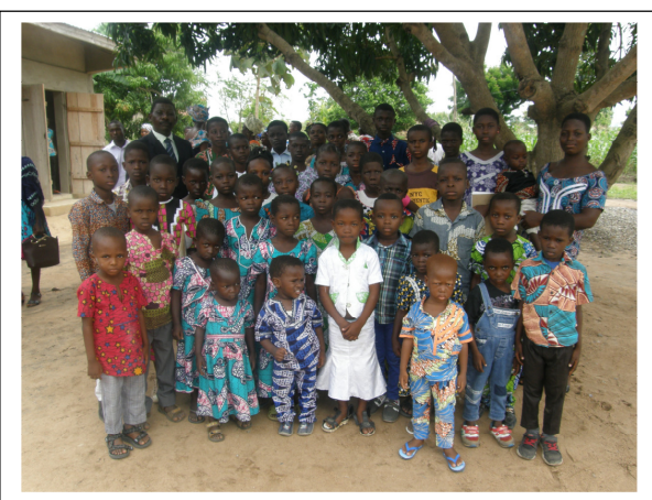
Children after Sunday morning services, August 2018