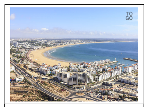
Lomé, the Capital City (Harbor area)