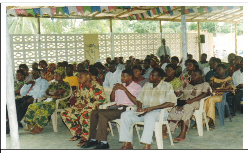
Sunday morning church services under a shelter in 2006