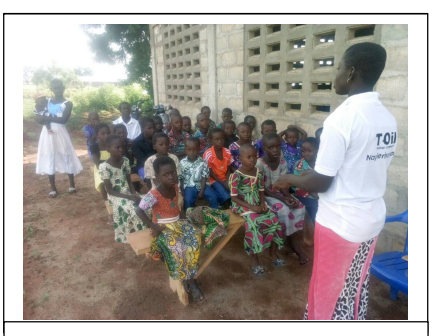
Children Sunday school, August 2018