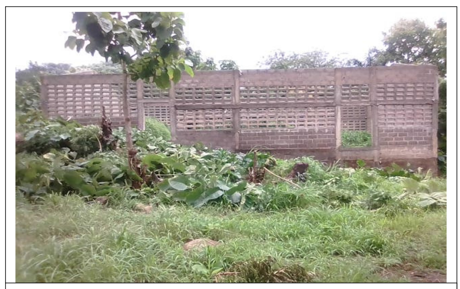
Church building progress, August 2018

<u>Prayer Requests</u>: (1) the Lord's provision to cover the church building, (2) the evangelism campaign in November (3) A good crowd on the inaugural Sunday.