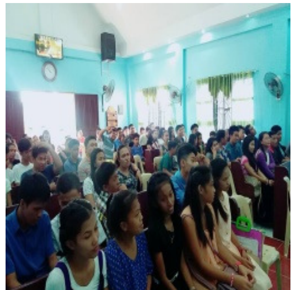
Youth Revival 2017