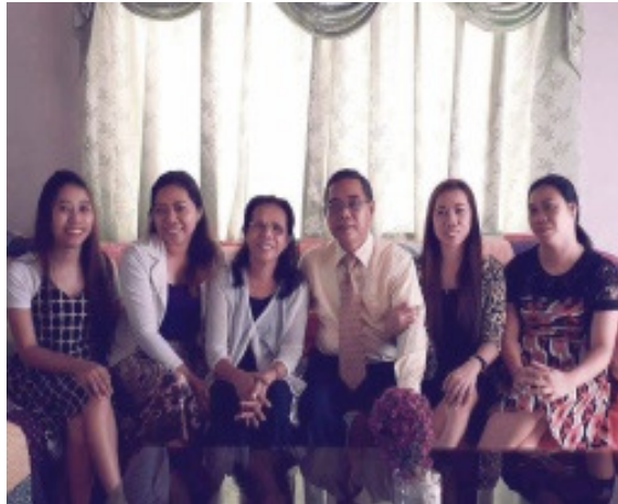
The Catriz Family