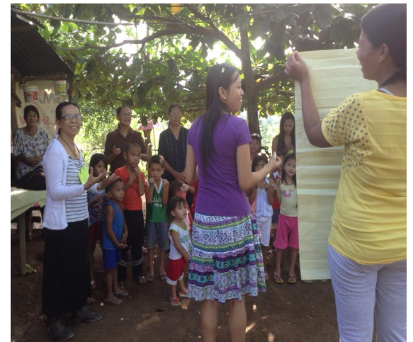
Mapanao Outreach Ministry