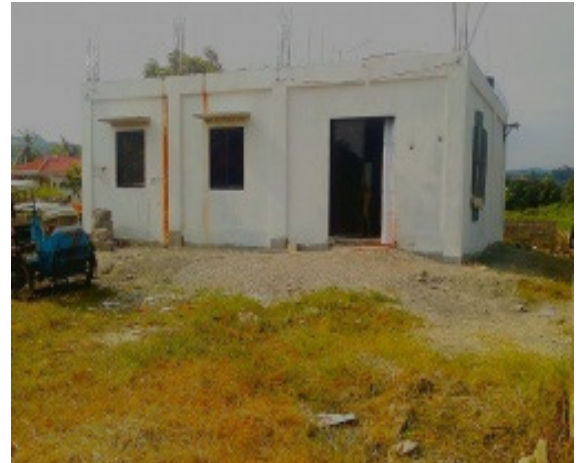
Our New House