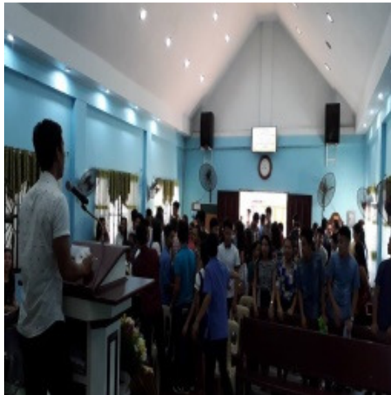
Youth Revival 2017