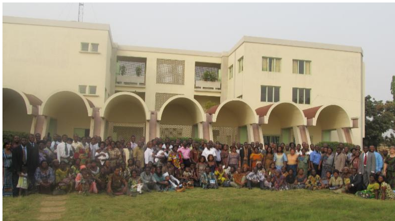
2011 Togo Marriage Conference Attendees