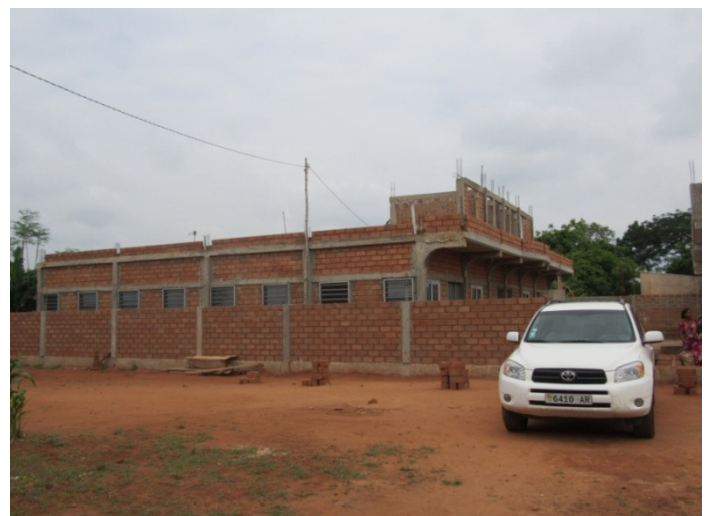
The present dormitory has the capacity to house 30 girls and 30 boys.

The Redeemer House has been in operation since September of 2015. It currently houses two girls and nine boys, ages 5 to 13 years old. Justine is in charge of this ministry. She is assisted by a lady and a gentleman serving full time. We expect more children to be added in the near future.