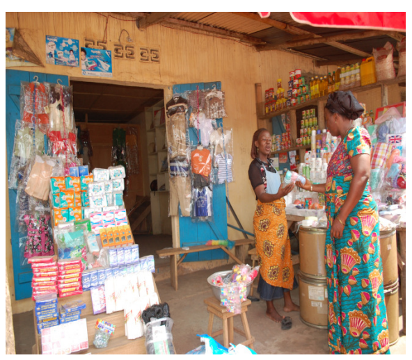
Beauty's wholesale and retail store