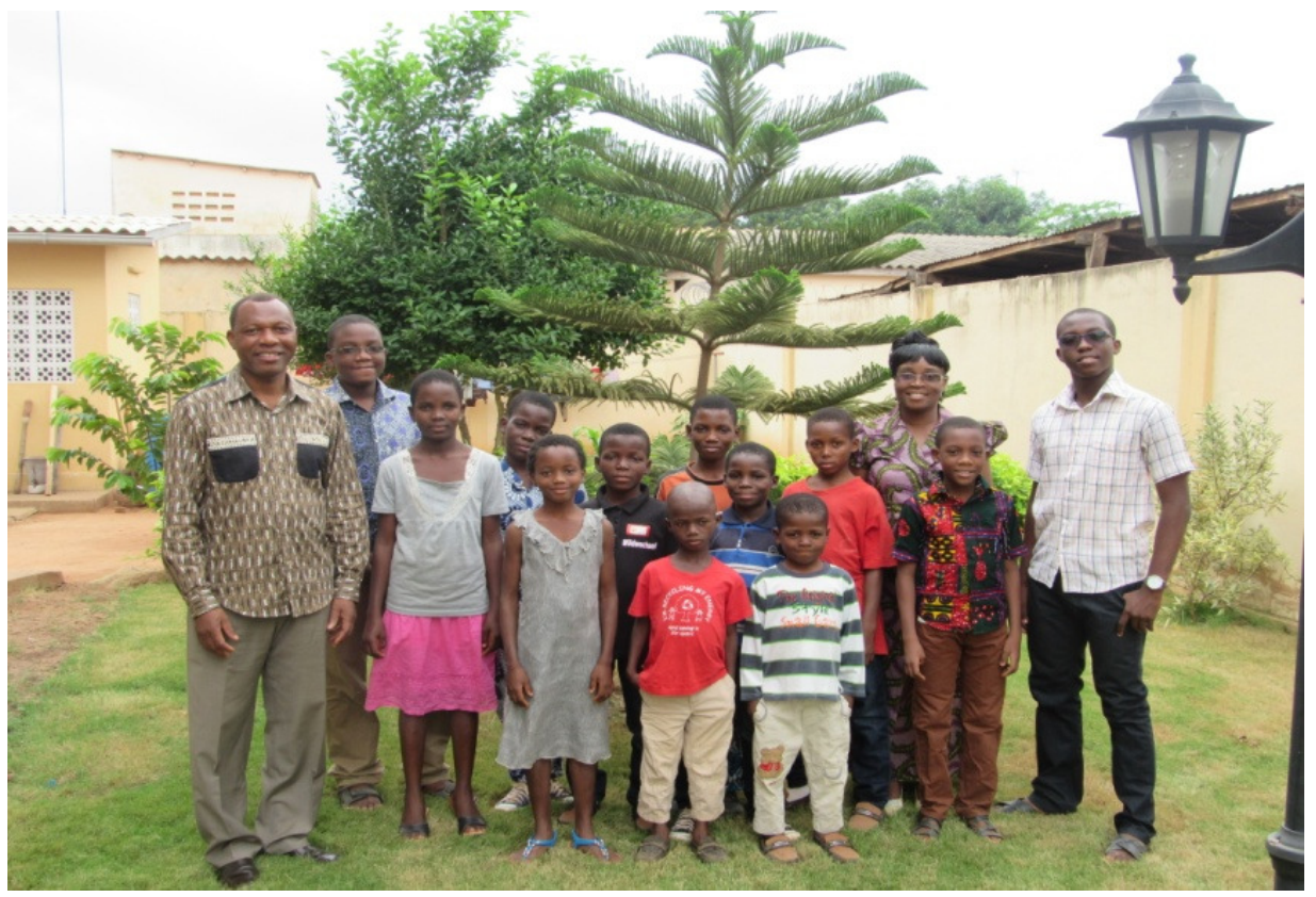
The Redeemer House kids at the Laodimas on Sunday July 17, 2016