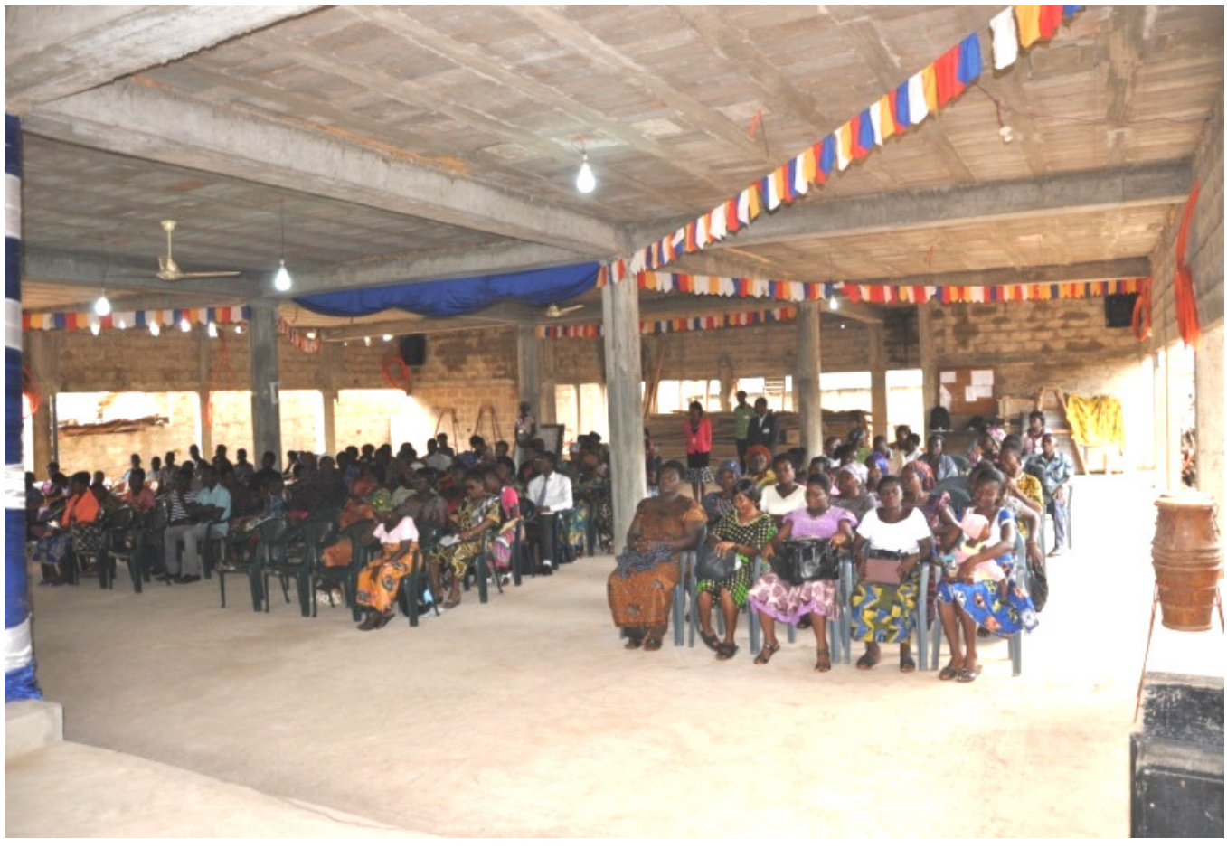
July 24, 2016 Sunday morning services