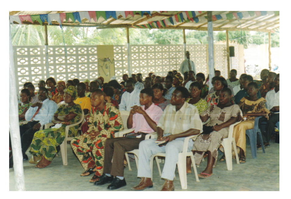
Sunday Morning Services, 2006