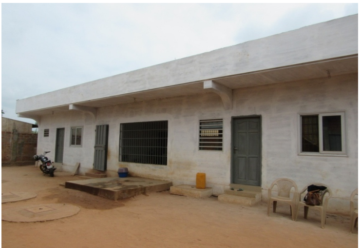
This building is the kitchen complex