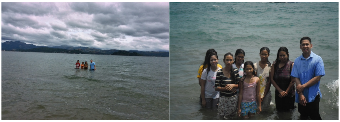
Our Recent Cawag Church Baptism