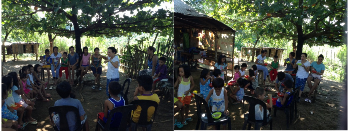
TBC Children's Outreach and Feeding Ministry