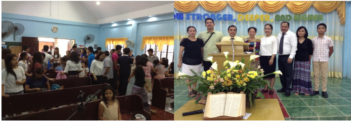
Family Sunday with Missionary Families