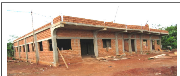
Orphanage dorms construction progress