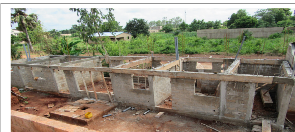
Orphanage kitchen, warehouse and cook dorm

As you can see, a lot of work must be done before we bring in the orphans. Please pray for the Lord’s provision in order for us to make the roughcasting, pose the tiles, fix the windows and the bathrooms, and install the lights. We will also need beds, mattresses and sheets. The Lord has already provided money for water drilling. All these works are to be done before the school resumes in September. We pray and expect that our LORD will meet all these needs.