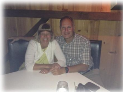
In June, we celebrated 26 years of marriage!