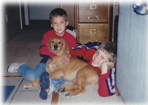
In mid-June, we said goodbye to our family dog– Buddy. We were blessed with 13 years of faithful friendship as he watched our kids all grow up.