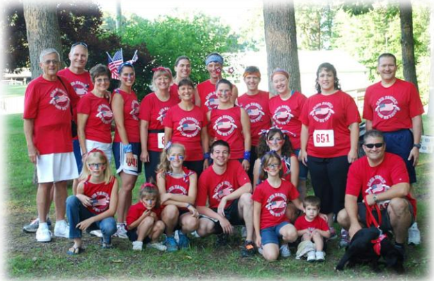
The Iler Family celebrated Independence Day this year by participating in a 5 mile /5K Run.