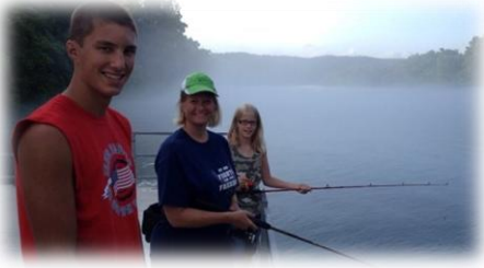
Fishing for trout in Lake Taneycomo in Missouri in July.