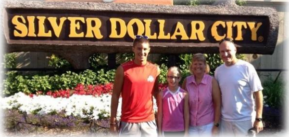
In July, we returned to one of our favorite vacation spots – Branson!